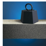
High compressive strength